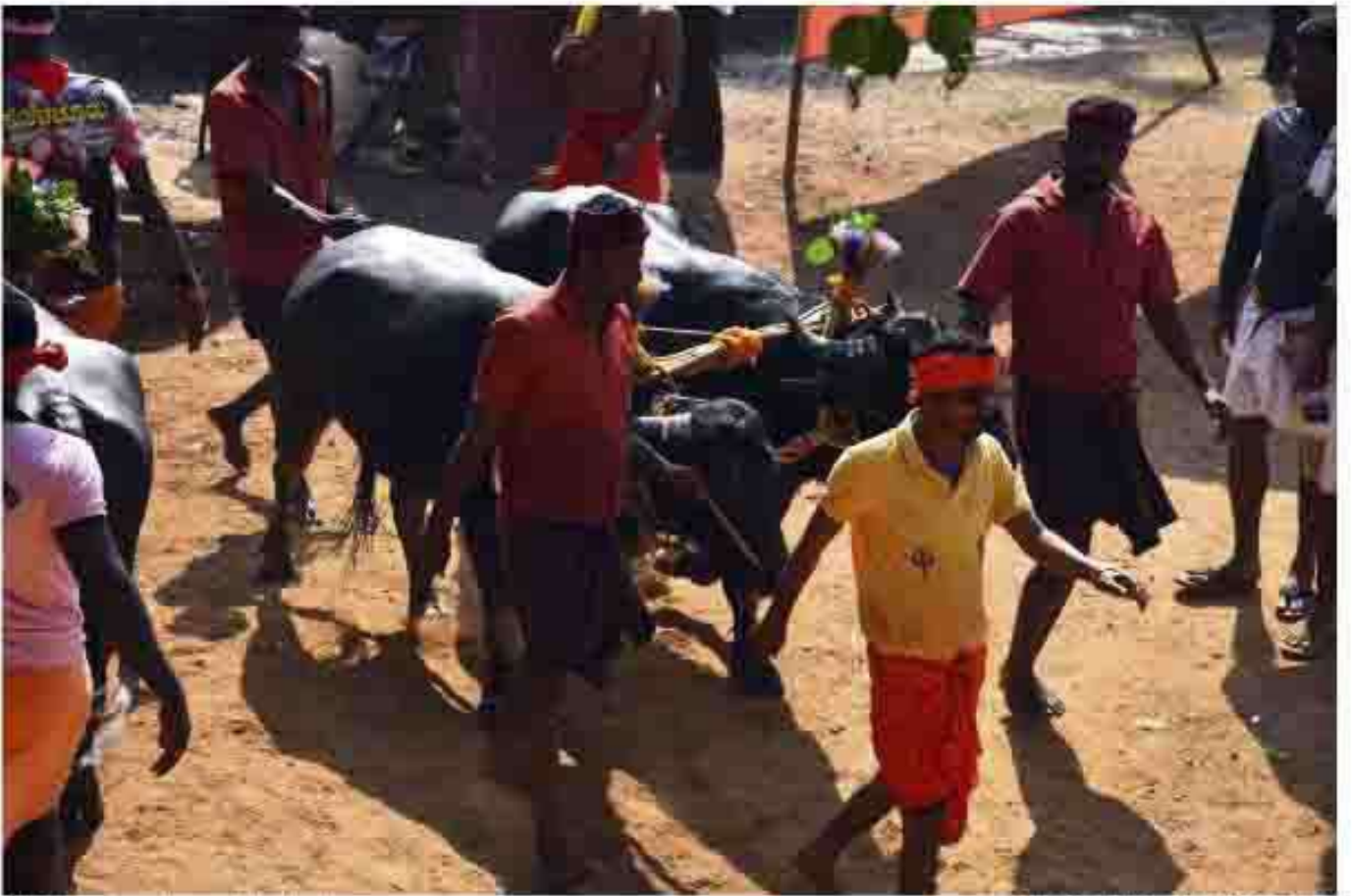
Buffaloes owners to reach the track