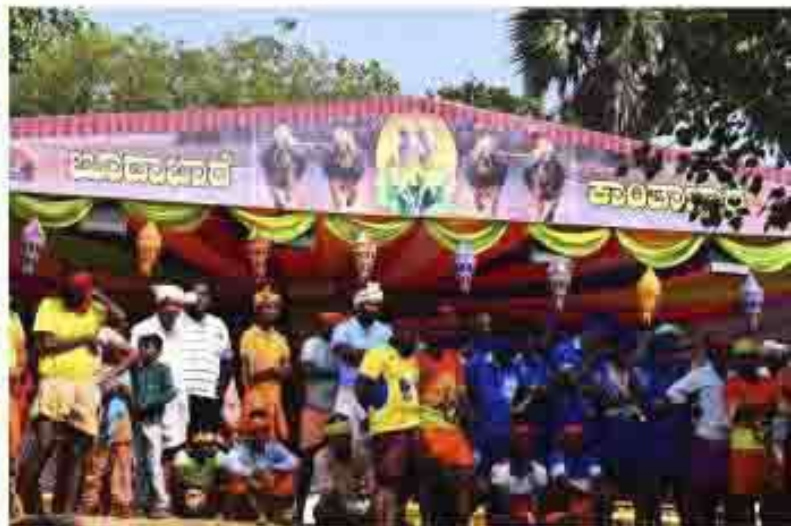
PEOPLE WATCH KAMBALA RACE-1