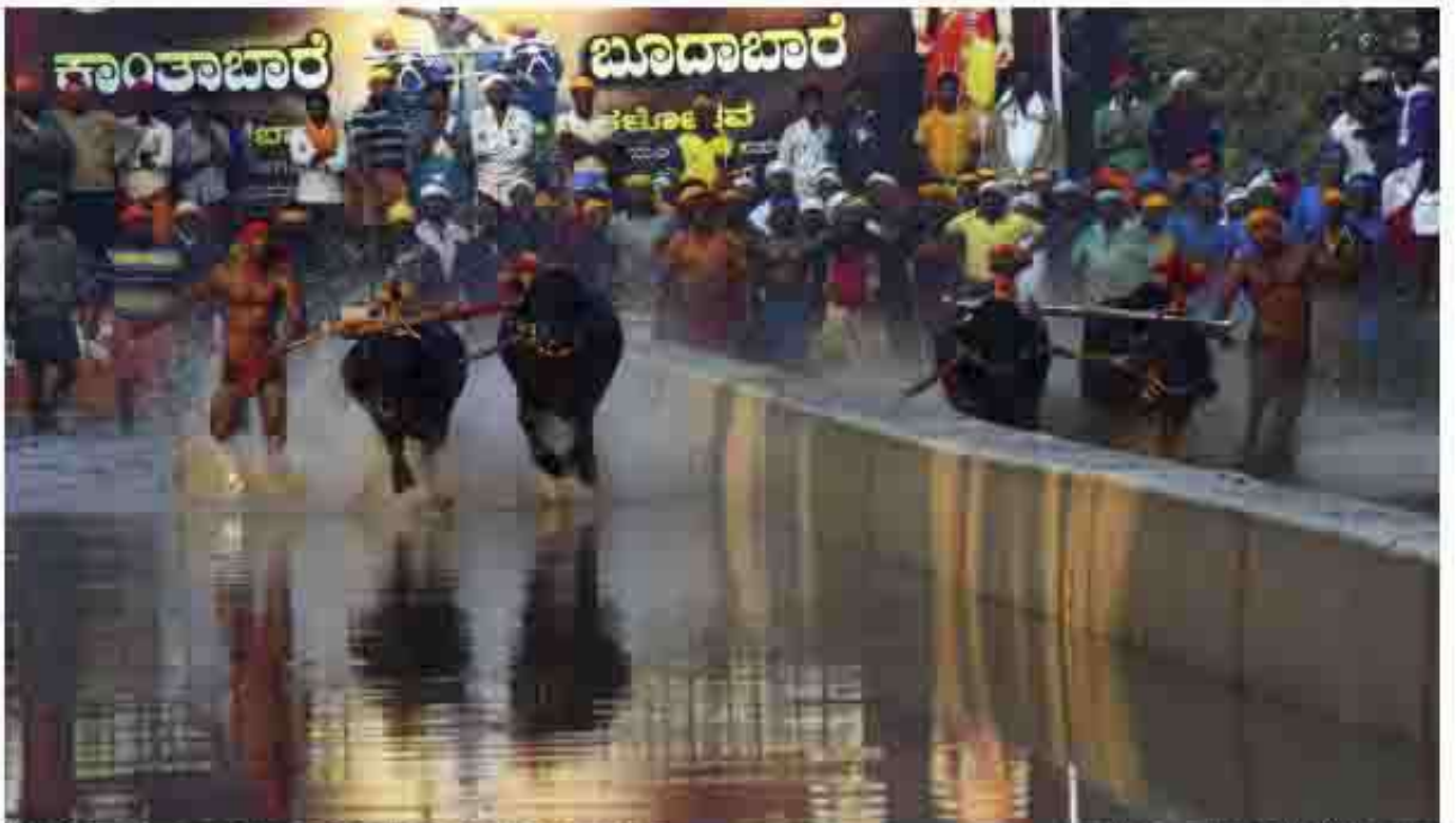
RIDERS IN ACTION ON THE TRACK OF KAMBALA RACE-3