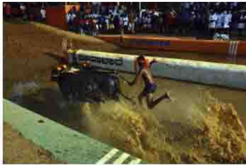
RIDERS IN ACTION ON THE TRACK OF KAMBALA RACE-7