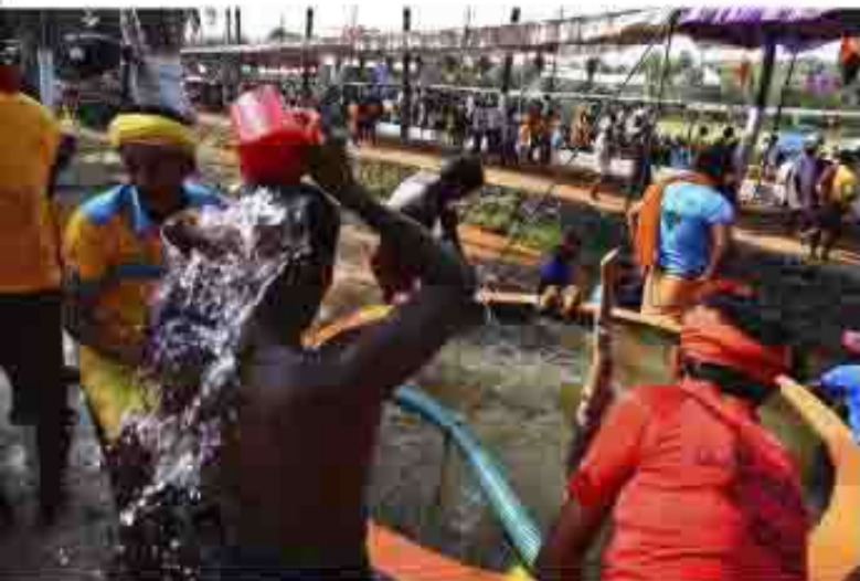
RIDERS BATHING AFTER THE RACE