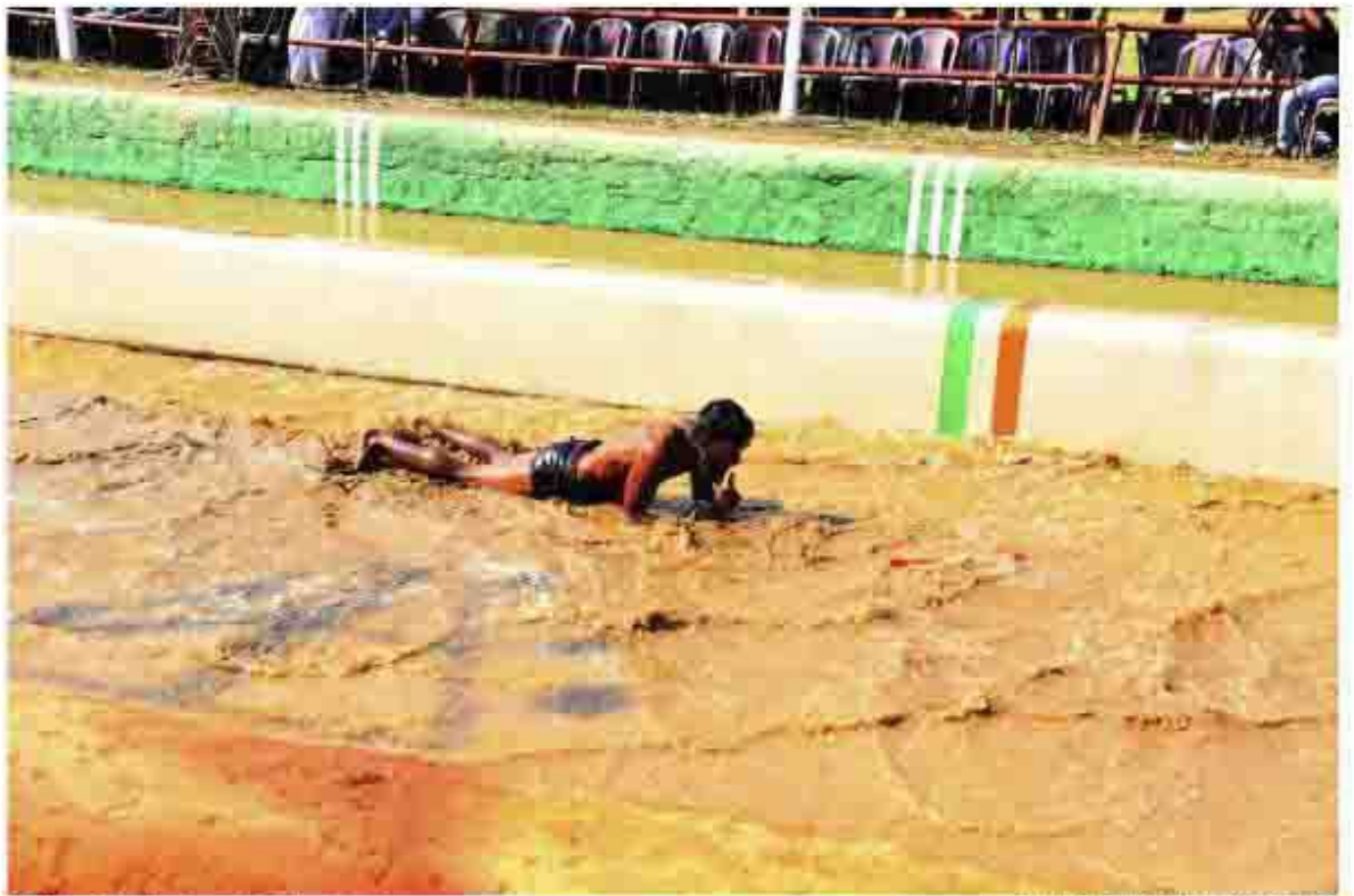
A Rider Slip The Race On The Track