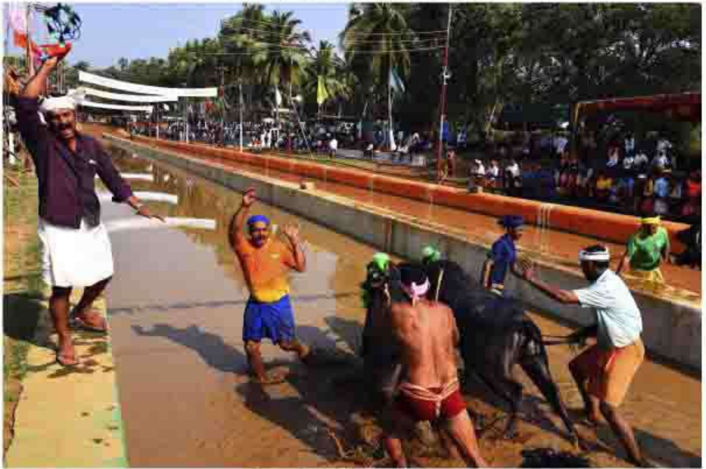
Referee Begins The Kambala Race

Kambala race, a very traditional race game conducted from so many years. Every second creates tension in viewers at the Kambala race place. Once the race begins, first 9 to 10 seconds are very crucial, even photographers also start taking pictures from starting because anything may happen in the race as it is involved with balancing and running with buffaloes