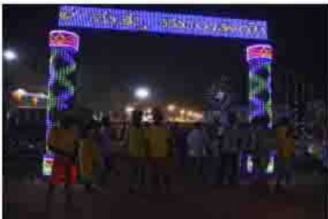
Kambala Race Venue

Traditionally Kambala was non competitive and the pair were run one by one. In modern Kambala the race generally