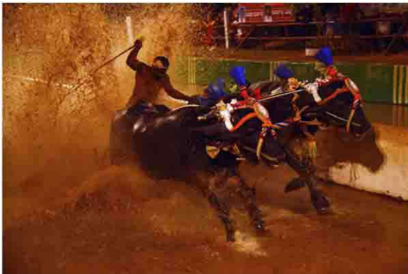
Riders in action on the track of Kambala Race-6