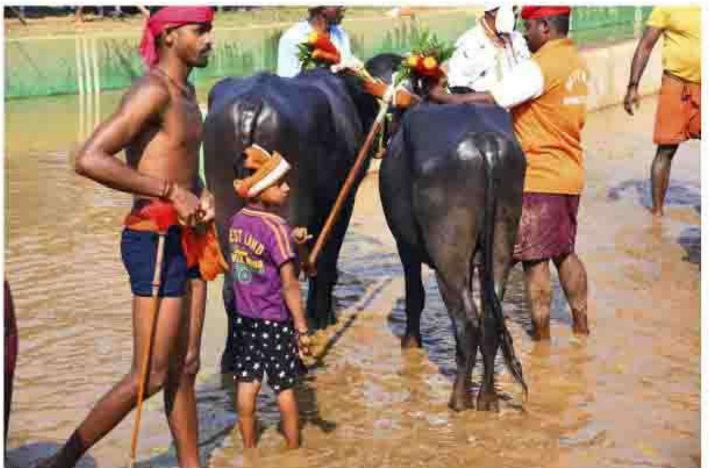
Child Also Participate In The Race