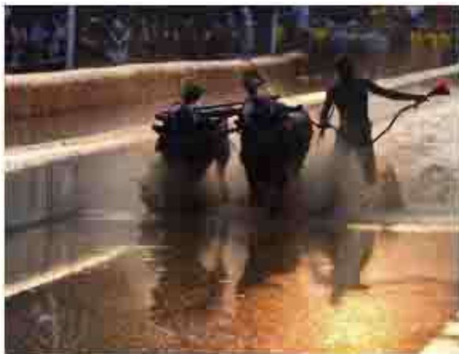
Riders in action on the track of Kambala Race-2

takes place between two pairs of buffaloes. This race track performed on two parallel race tracks filled with slushy water.