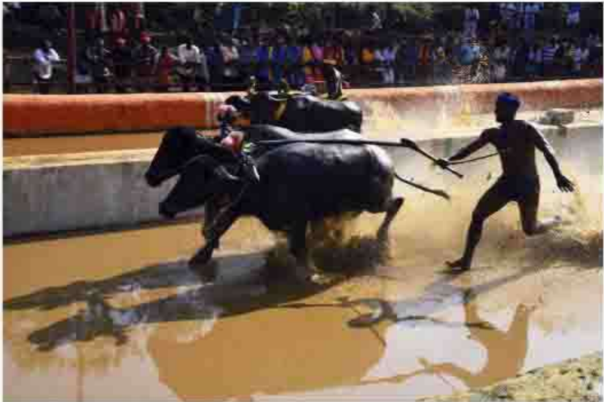
RIDERS IN ACTION ON THE TRACK OF KAMBALA RACE-1