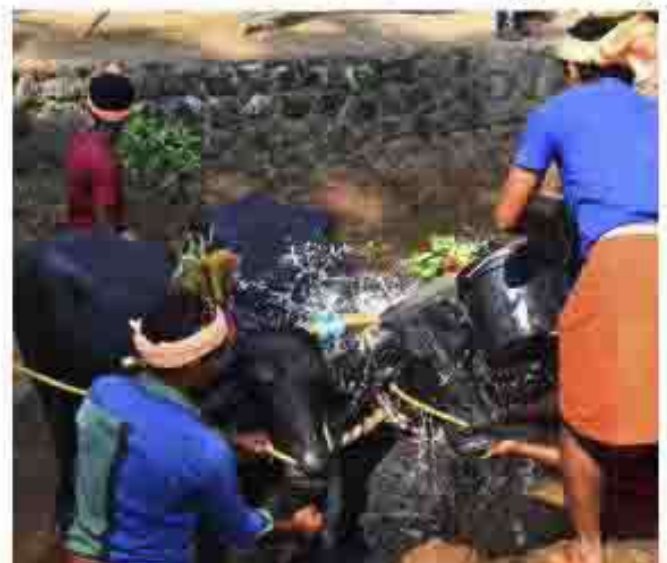
Buffaloes Owners Cleaning Their Pairs