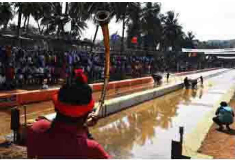
KAMBALA RACE TRACK