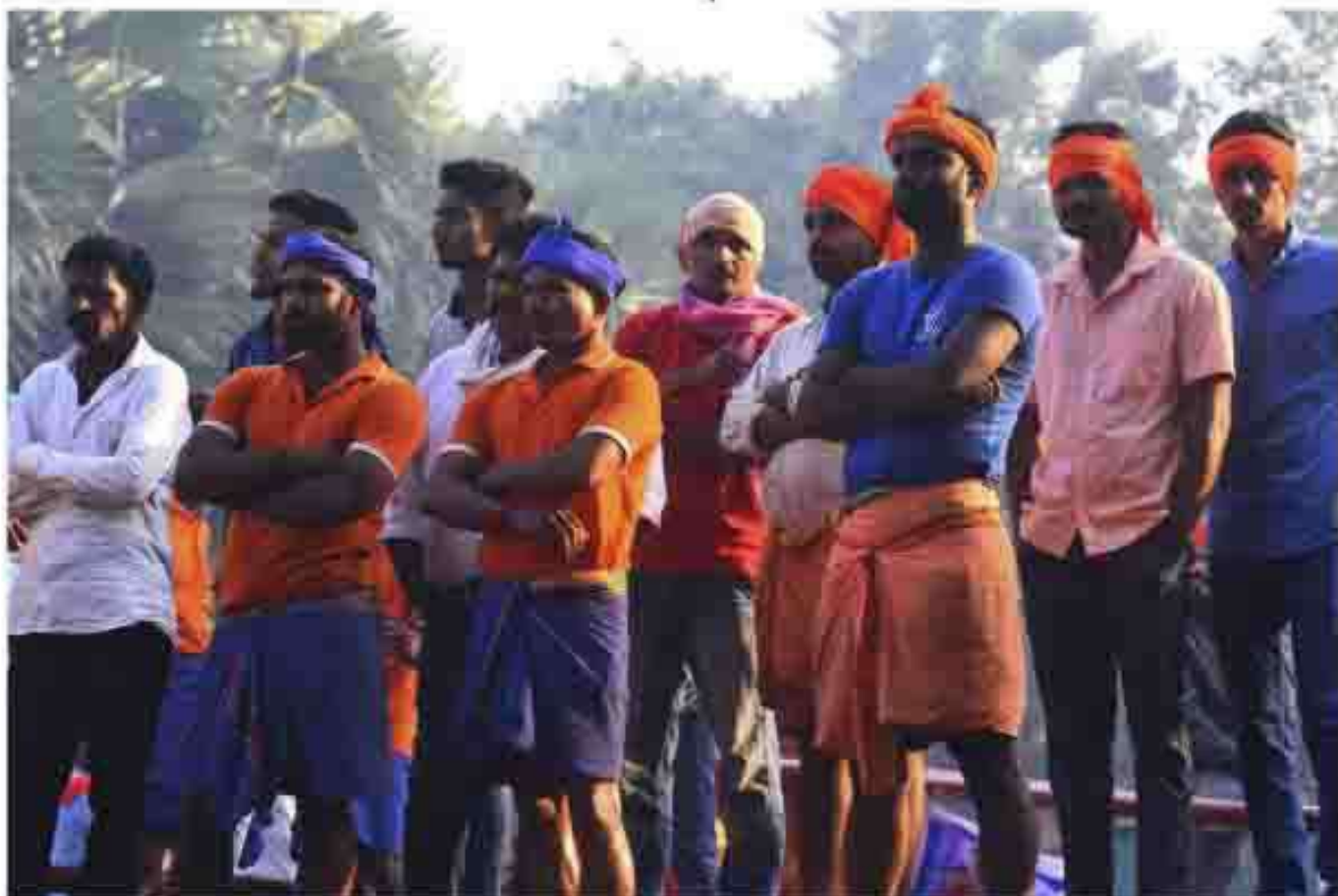
PEOPLE WATCH KAMBALA RACE

Buffaloes owners and farmers in the region take great care of their buffaloes and best of them are well fed, oiled and nurtured for a race in Kambala. The best of Kambala buffaloes can cover 140 meter race track in less than 12 seconds. The pair of buffaloes cost 50 lakhs above. Winning owners earn Gold and silver coins. Some organising committees present an eight gram gold coin as first prize, in some places cash prizes are awarded.