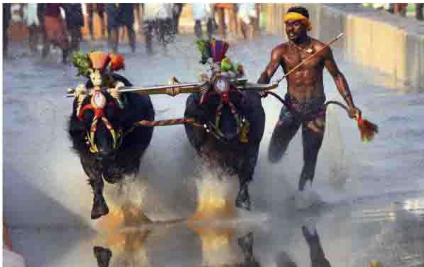
Riders in action on the track of kambala race-4